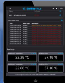
Computer and Smart Devices